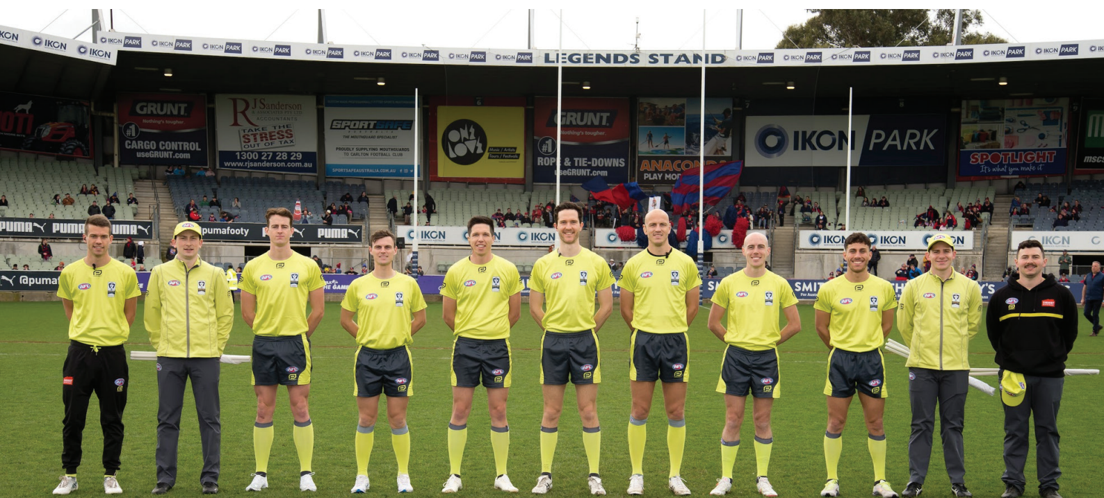
2022 VFL Grand Final Panel