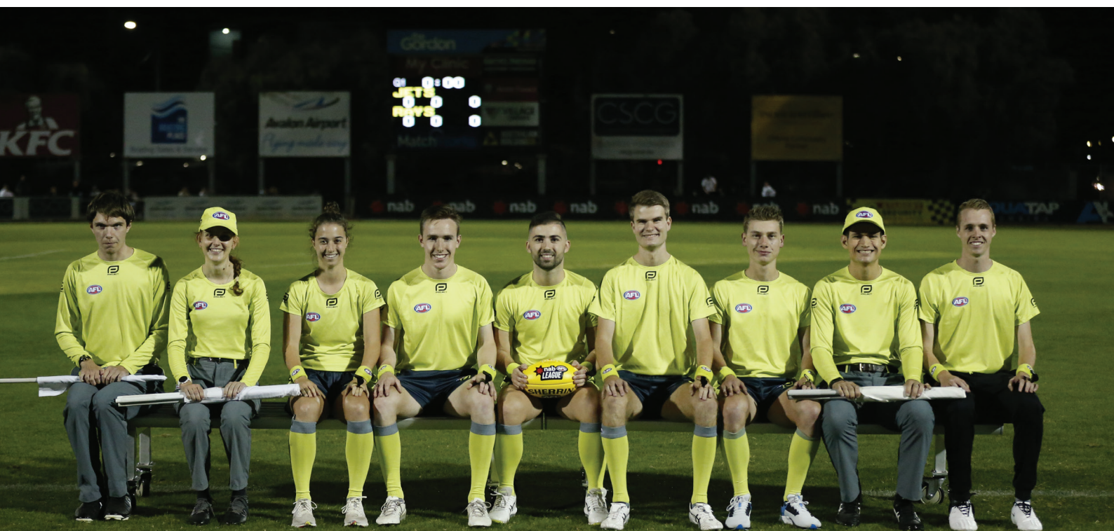
2022 NAB League Girls Grand Final Panel