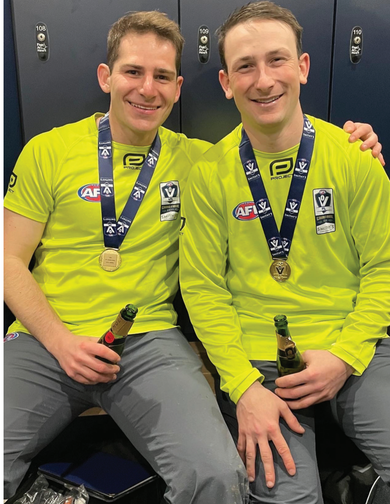
Senior Goal Umpire Panel

Looking forward to an even bigger and better year next year!