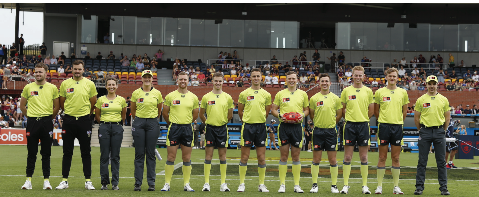
Season 7 AFLW Grand Final Umpiring Panel