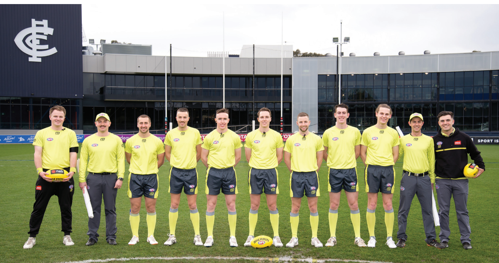
2022 NAB League Boys Grand Final Panel