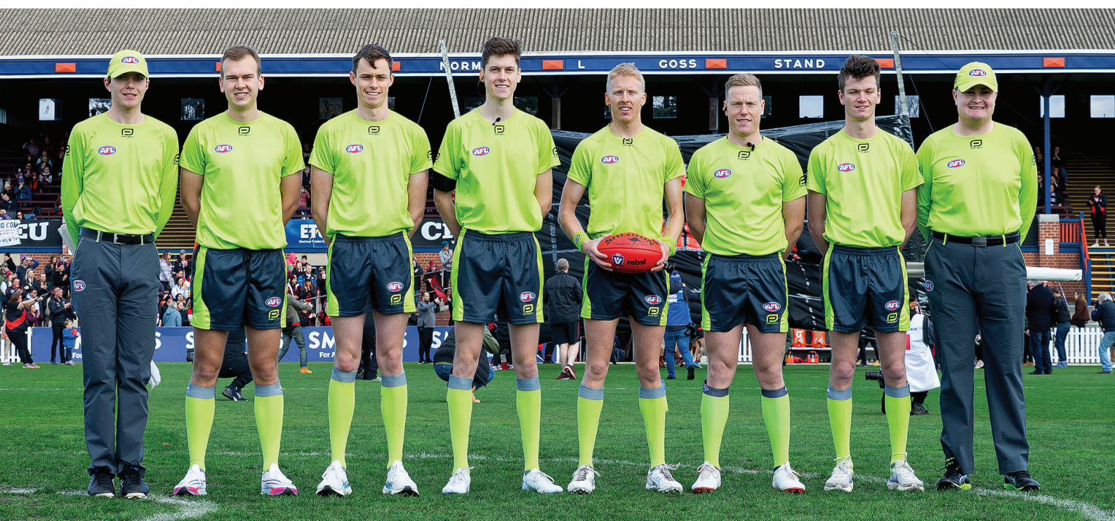
2022 VFLW Grand Final Panel